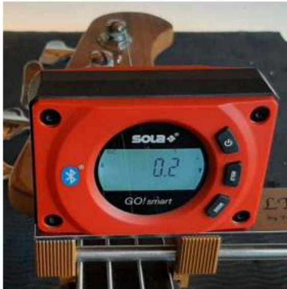
Figure 5. Example of an anti-clockwise twist of 0.3^\circ as indicated by the arrows. For a level position a clock-wise turn is needed.

may still be addressed with compensating fretwork leveling, but values > 3.0^\circ will get into the area of rework on the fretboard itself (with fret removal accordingly).