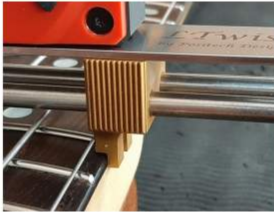
Figure 3. The sliding right-hand leg of the LTWIST® gauge in position on the fretboard.