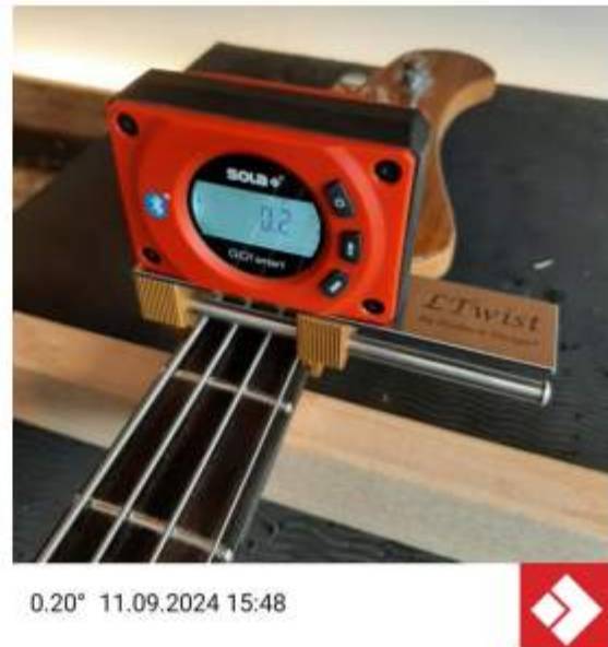
Figure 6. Photo with validated data log and date/time.

The measured values can be documented with a photo of the gauge display on the instrument, including a data log from the Measures app with a time and data stamp (see Fig. 6). This provides a real-time report of the measuring results of the individual instrument.