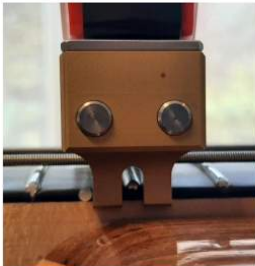
Figure 4. Notch in the leg of the LTWIST® gauge bridging a fret.