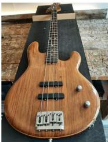
Figure 1. Guitar in a flat position on a stable workbench surface.